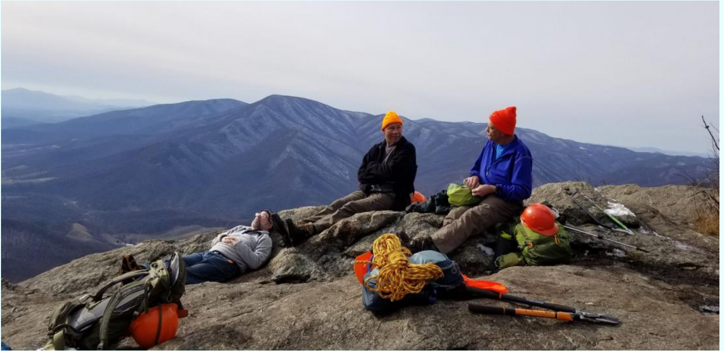
Hanging Rock on Three Ridges A.T.