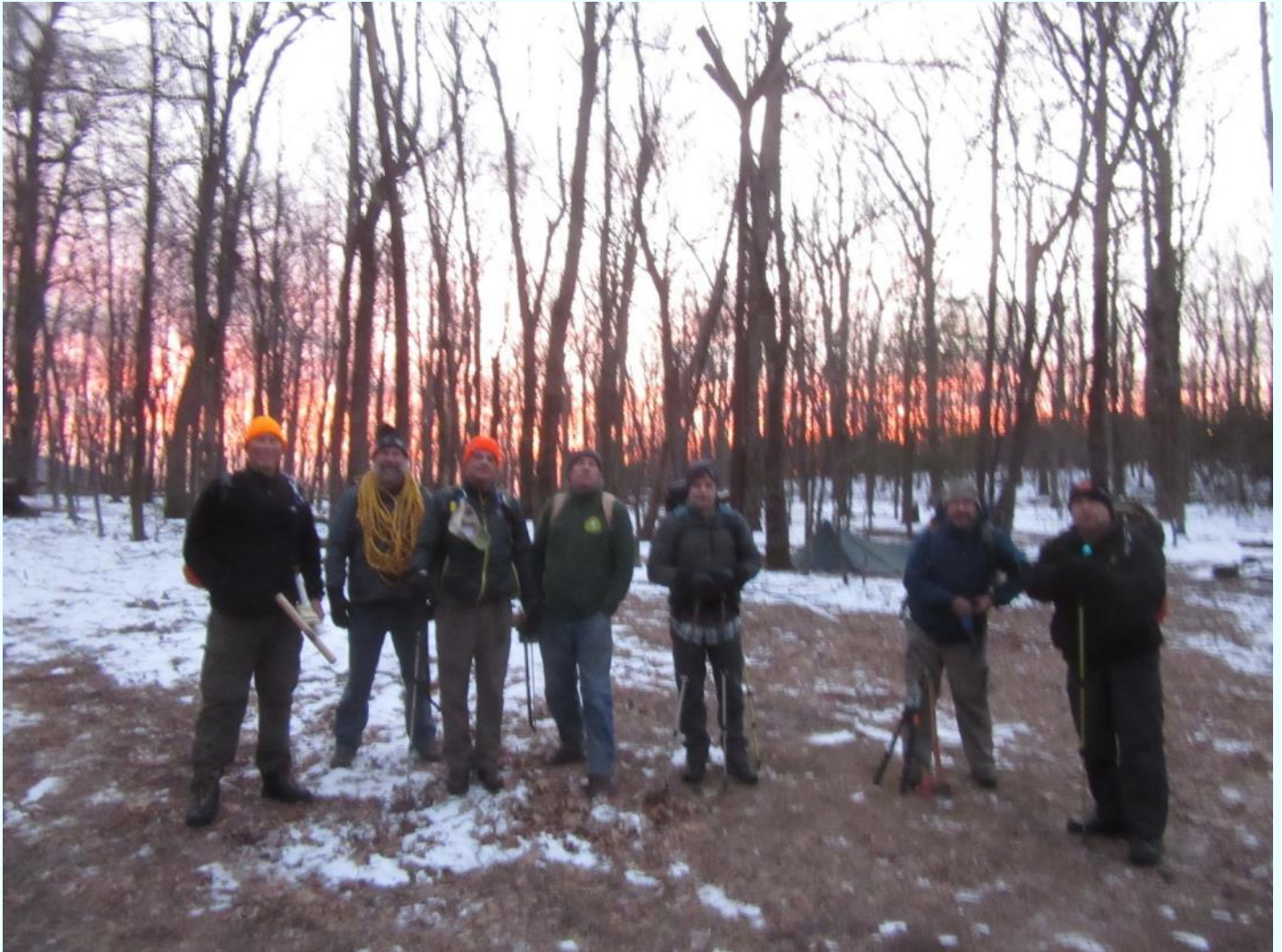
Sunrise at Maupin Field TATC Work Crew Assembles