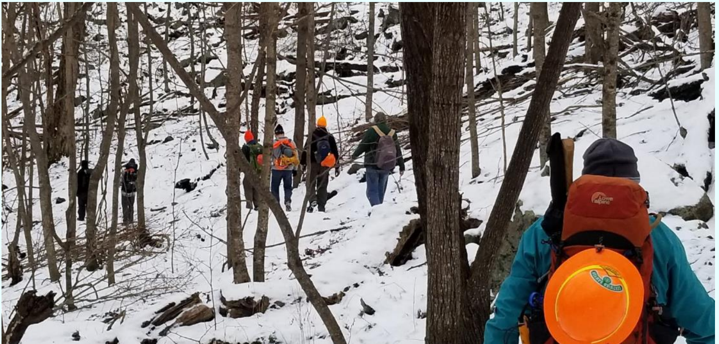
Hiking back to Maupin--joint crews on A.T.