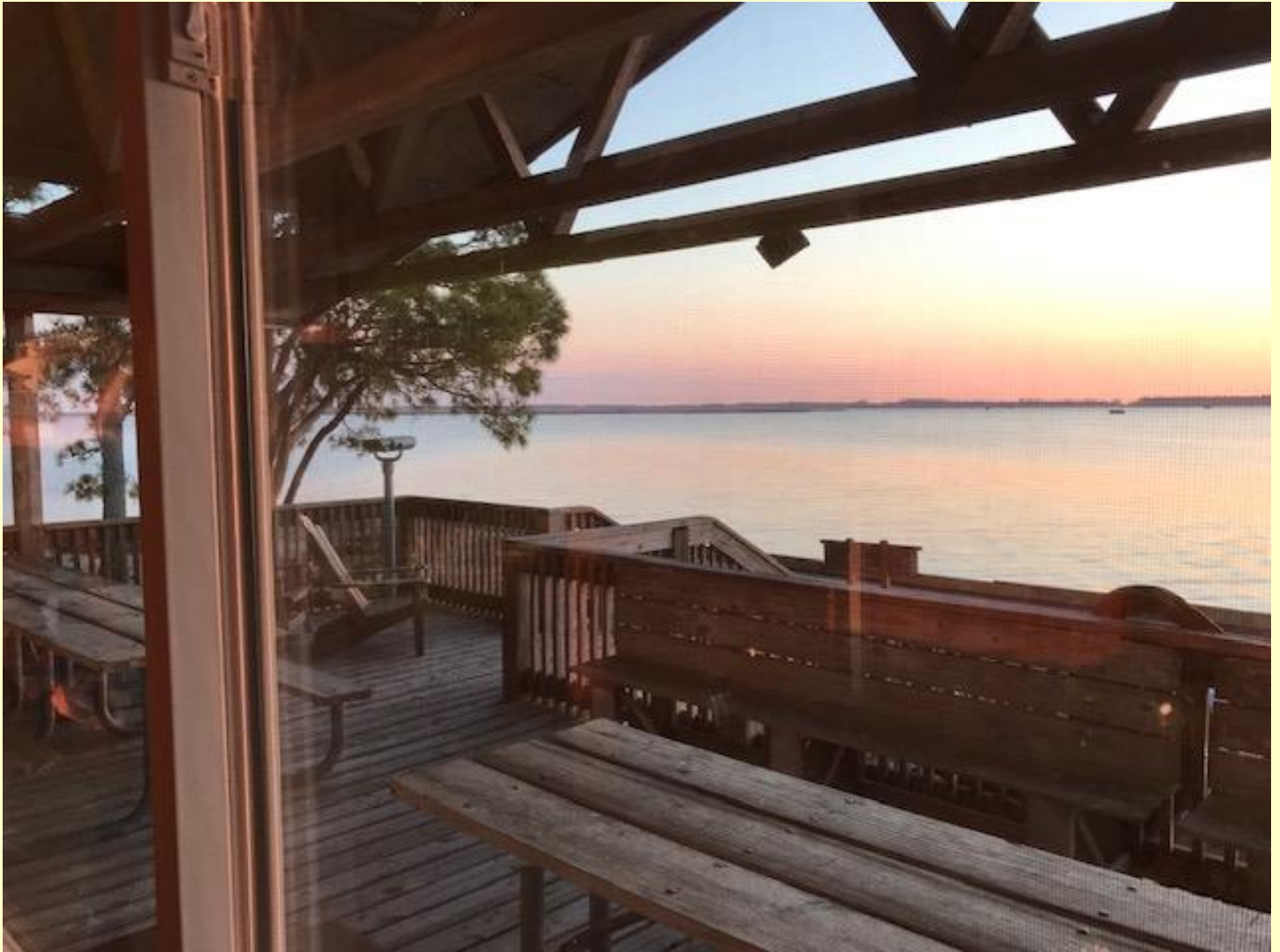
Sunrise off the Front Porch