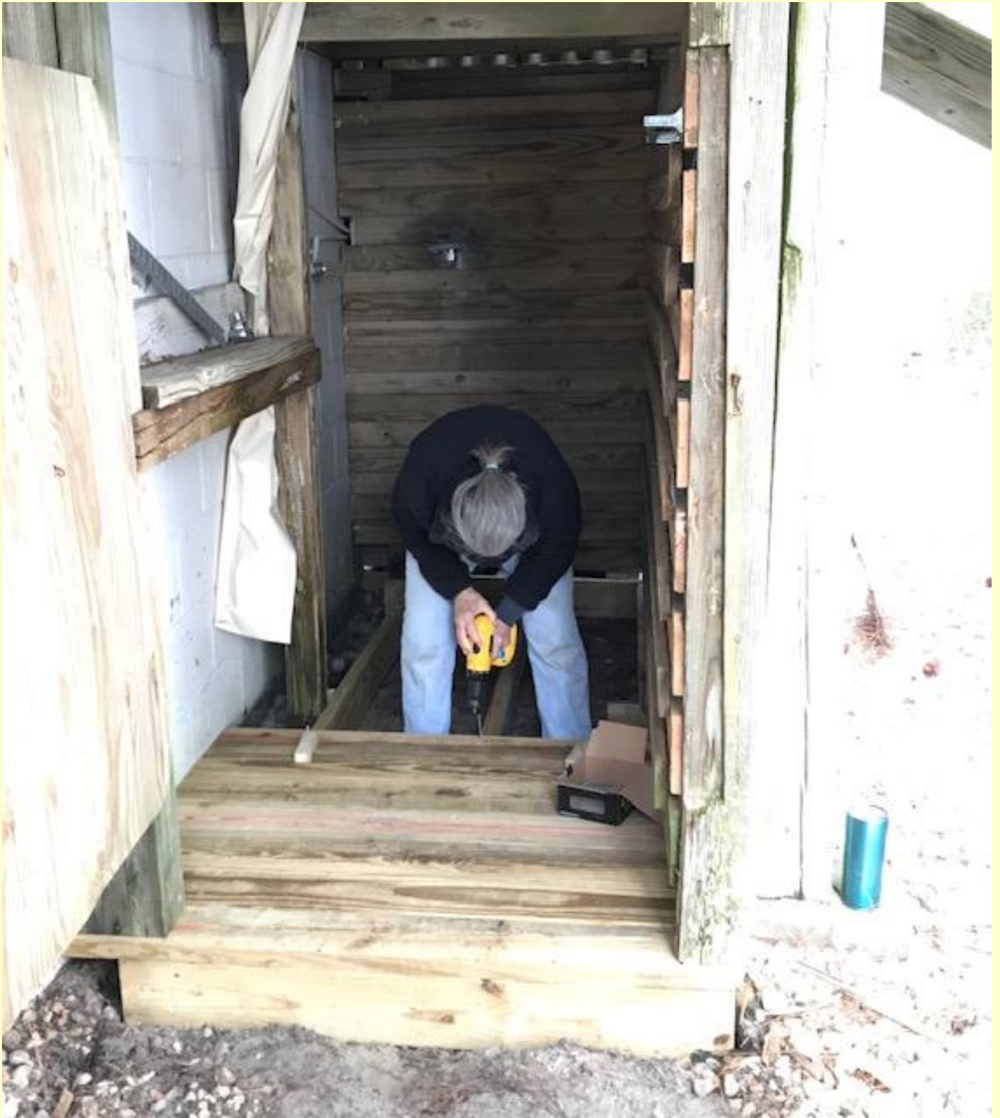
Drilling Down a New Floor for the Outdoor Shower